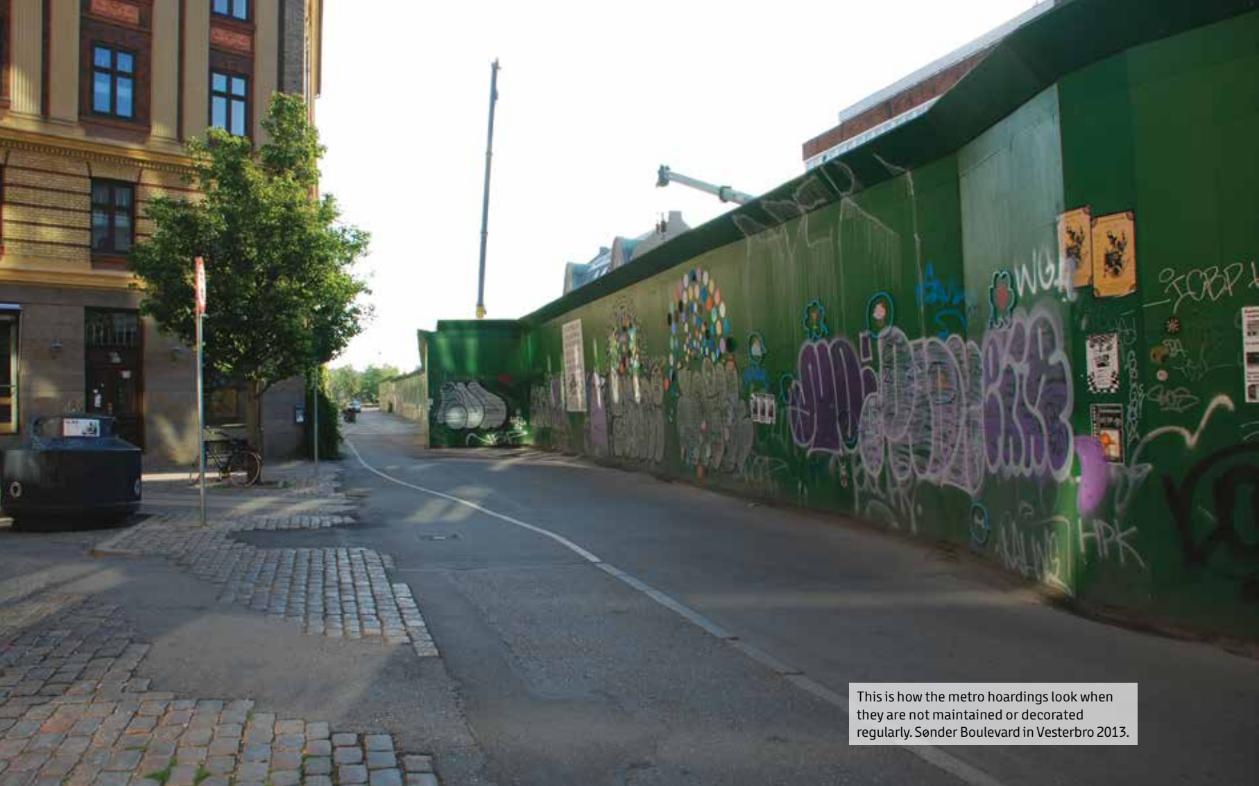
This is how the metro hoardings look when they are not maintained or decorated regularly. Sønder Boulevard in Vesterbro 2013.