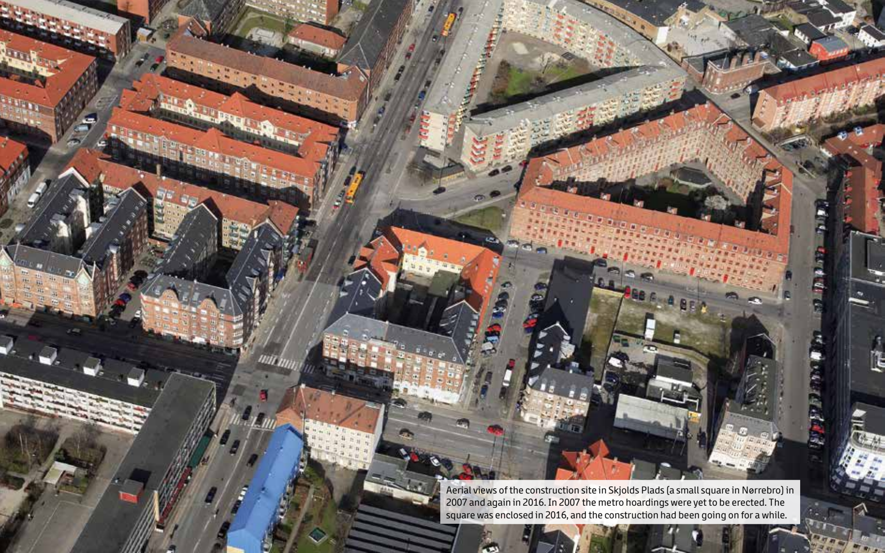
Aerial views of the construction site in Skjolds Plads (a small square in Nørrebro) in 2007 and again in 2016. In 2007 the metro hoardings were yet to be erected. The square was enclosed in 2016, and the construction had been going on for a while.