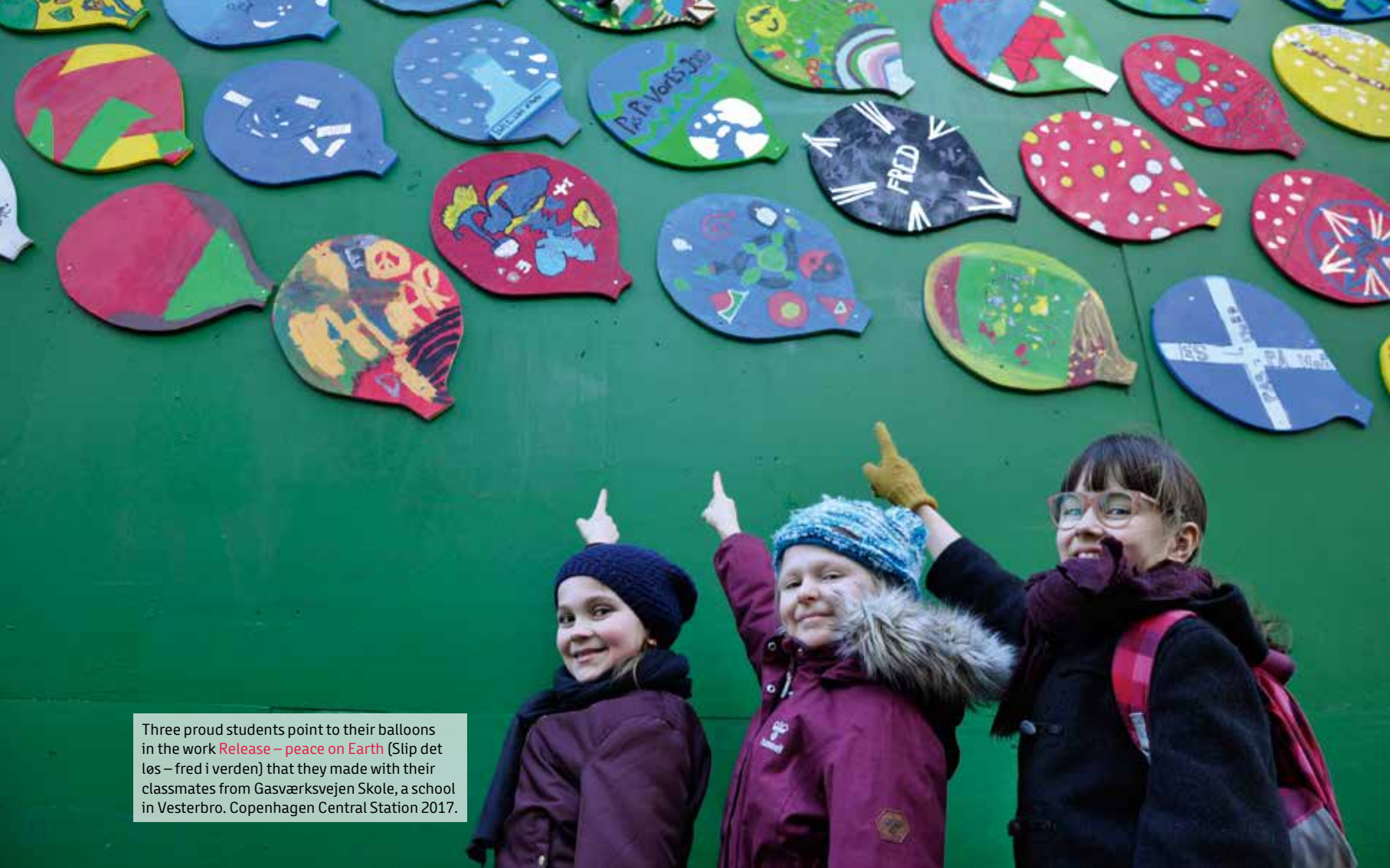
Three proud students point to their balloons in the work Release – peace on Earth (Slip det løs – fred i verden) that they made with their classmates from Gasværksvejen Skole, a school in Vesterbro. Copenhagen Central Station 2017.