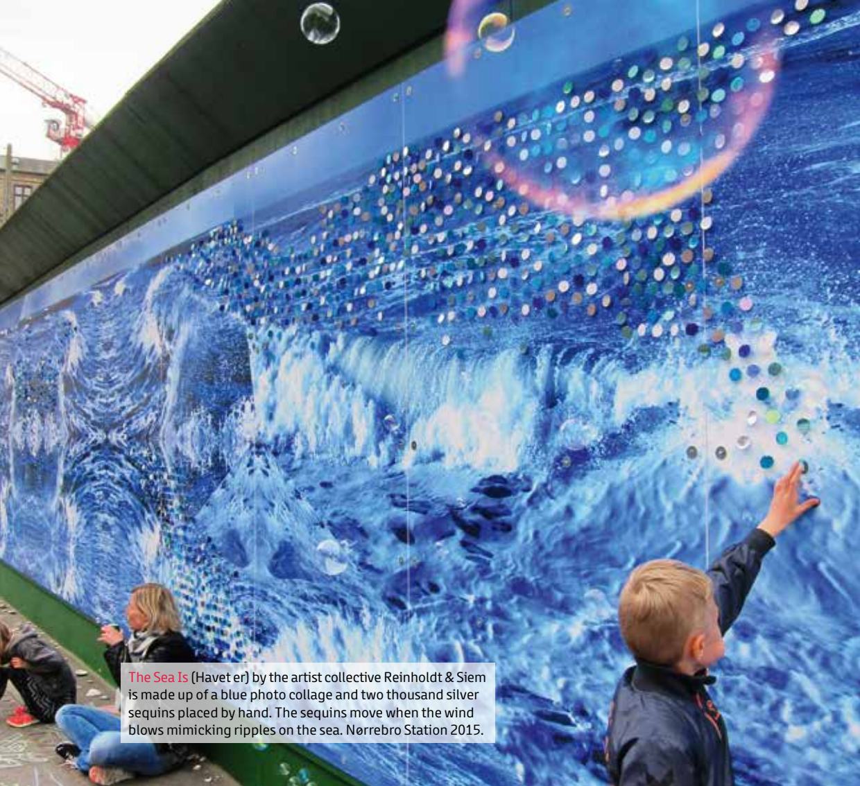
The Sea Is (Havet er) by the artist collective Reinholdt & Siem is made up of a blue photo collage and two thousand silver sequins placed by hand. The sequins move when the wind blows mimicking ripples on the sea. Nørrebro Station 2015.