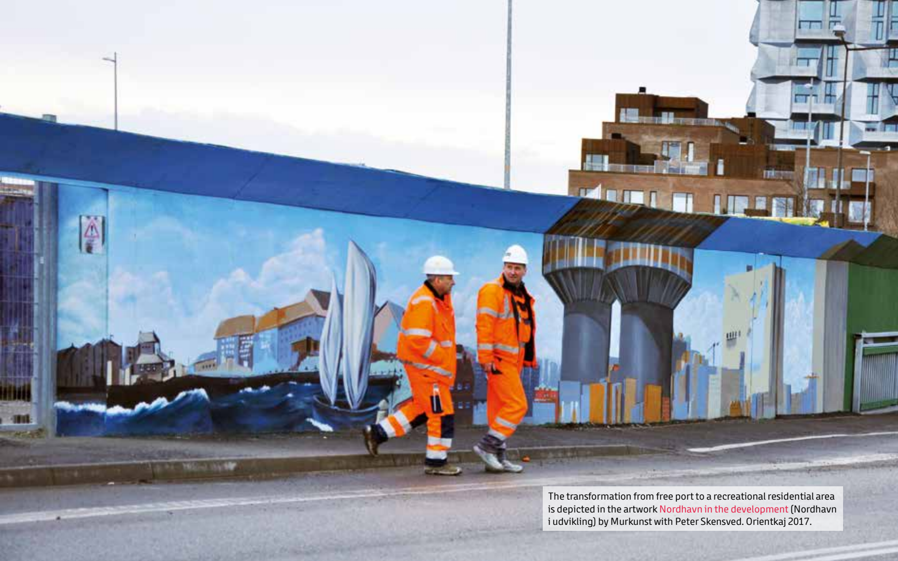
The transformation from free port to a recreational residential area is depicted in the artwork Nordhavn in the development (Nordhavn i udvikling) by Murkunst with Peter Skensved. Orientkaj 2017.