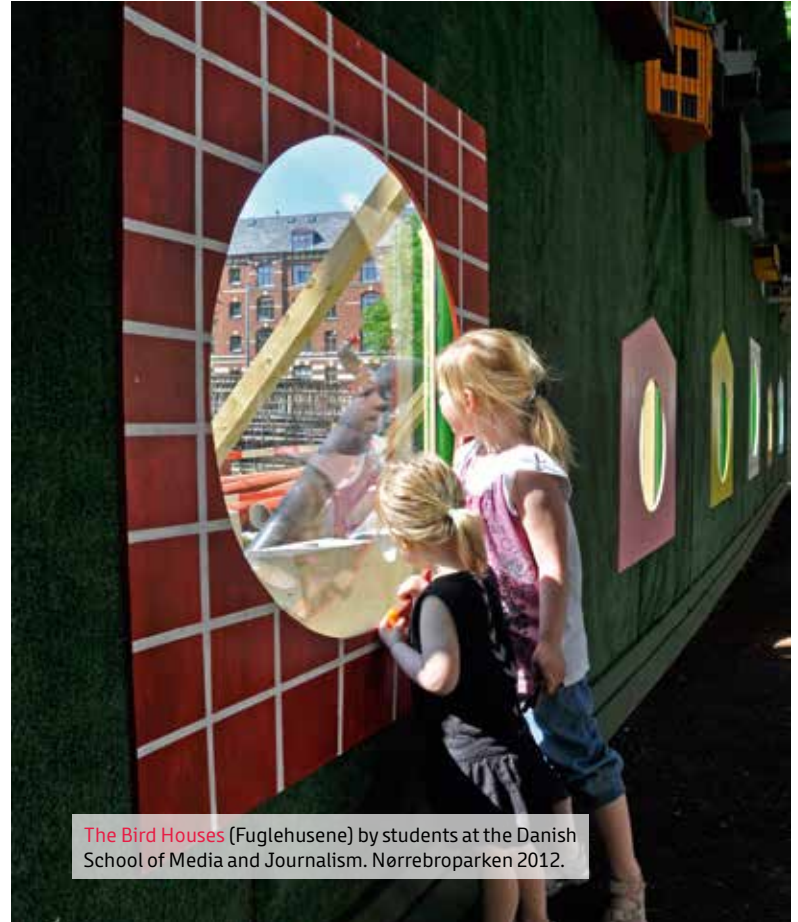
The Bird Houses (Fuglehusene) by students at the Danish School of Media and Journalism, Nørrebro Parken 2012.

Cool Construction is self-financing, and support for individual projects is financed by the sale of advertising space on dedicated parts of the hoardings. Metroselskabet's revenue that is generated from this goes entirely to the ongoing work of making the hoarding a vibrant part of the city.