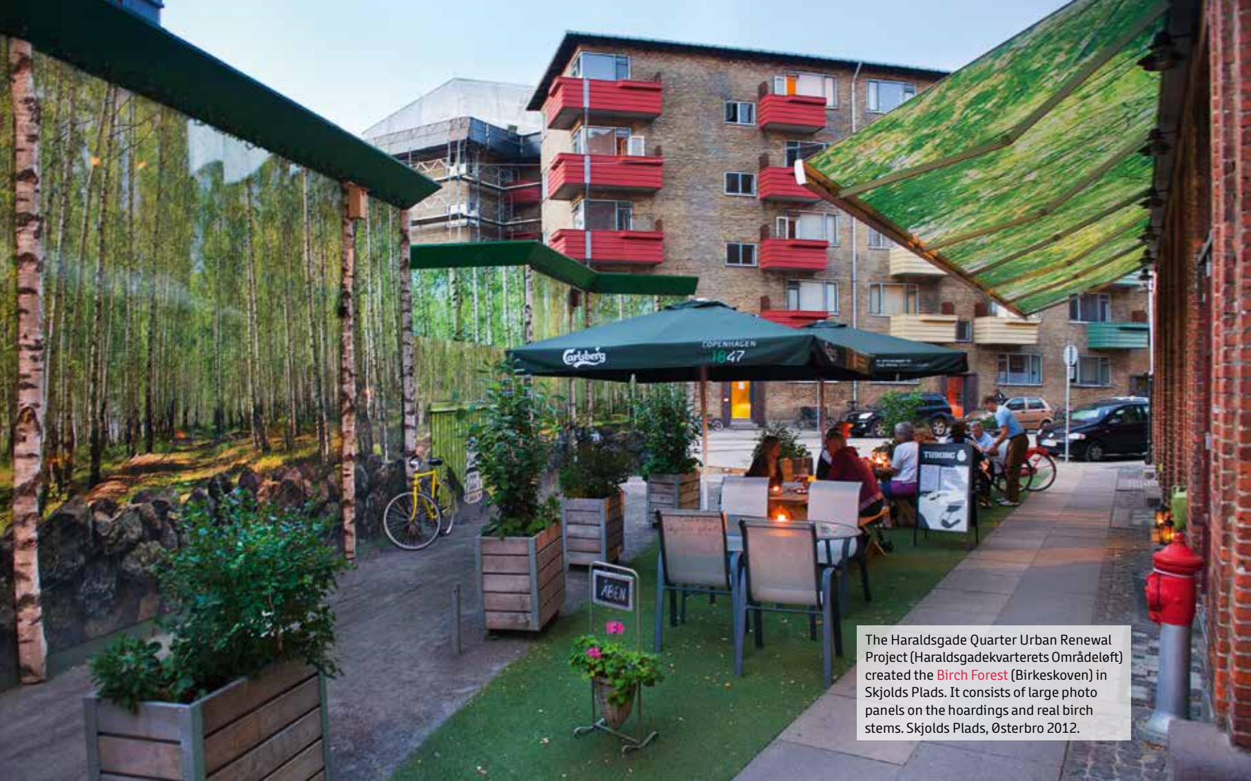
The Haraldsgade Quarter Urban Renewal Project (Haraldsgadekvarterets Områdeløft) created the Birch Forest (Birkeskoven) in Skjolds Plads. It consists of large photo panels on the hoardings and real birch stems. Skjolds Plads, Østerbro 2012.