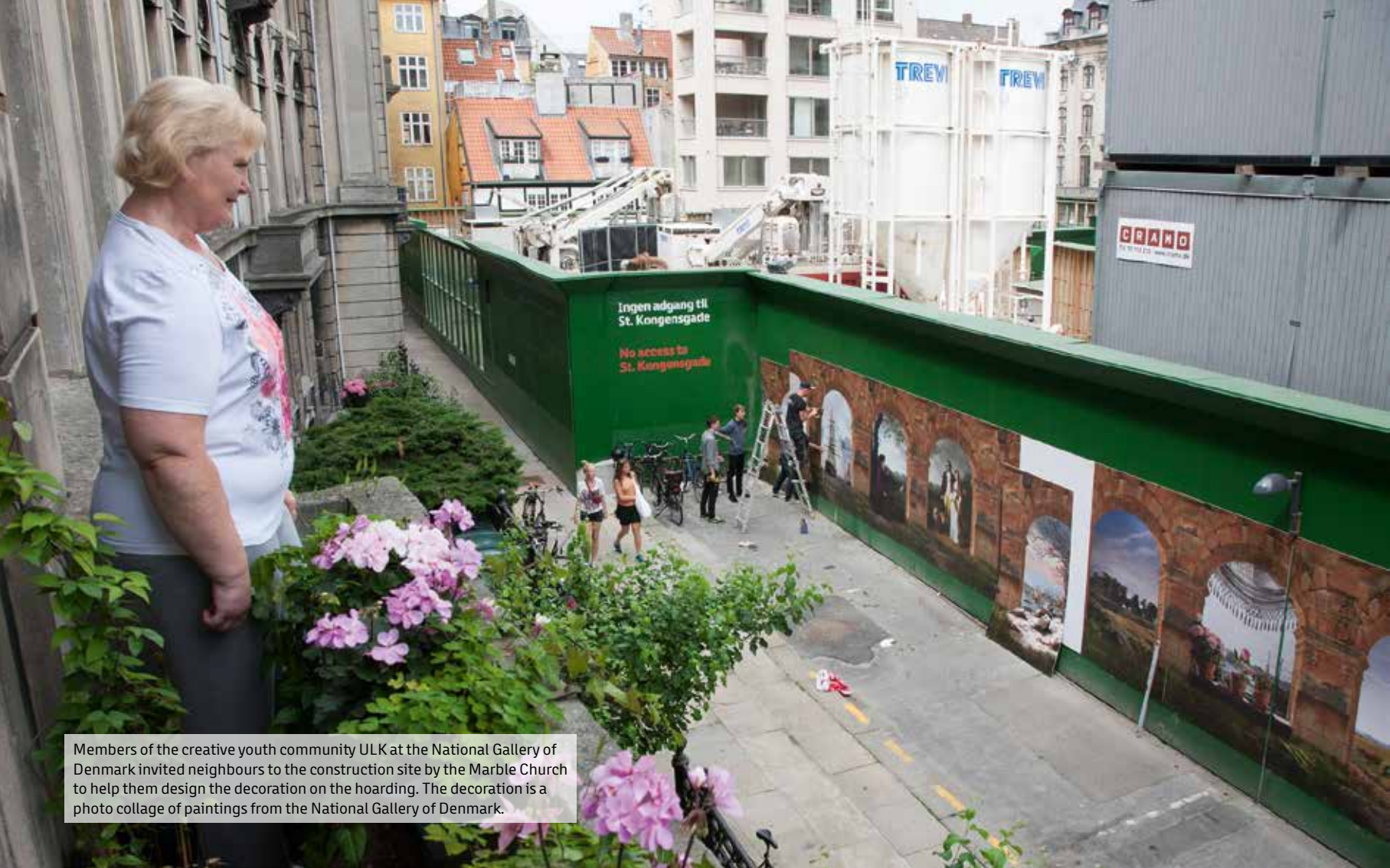
Members of the creative youth community ULK at the National Gallery of Denmark invited neighbours to the construction site by the Marble Church to help them design the decoration on the hoarding. The decoration is a photo collage of paintings from the National Gallery of Denmark.