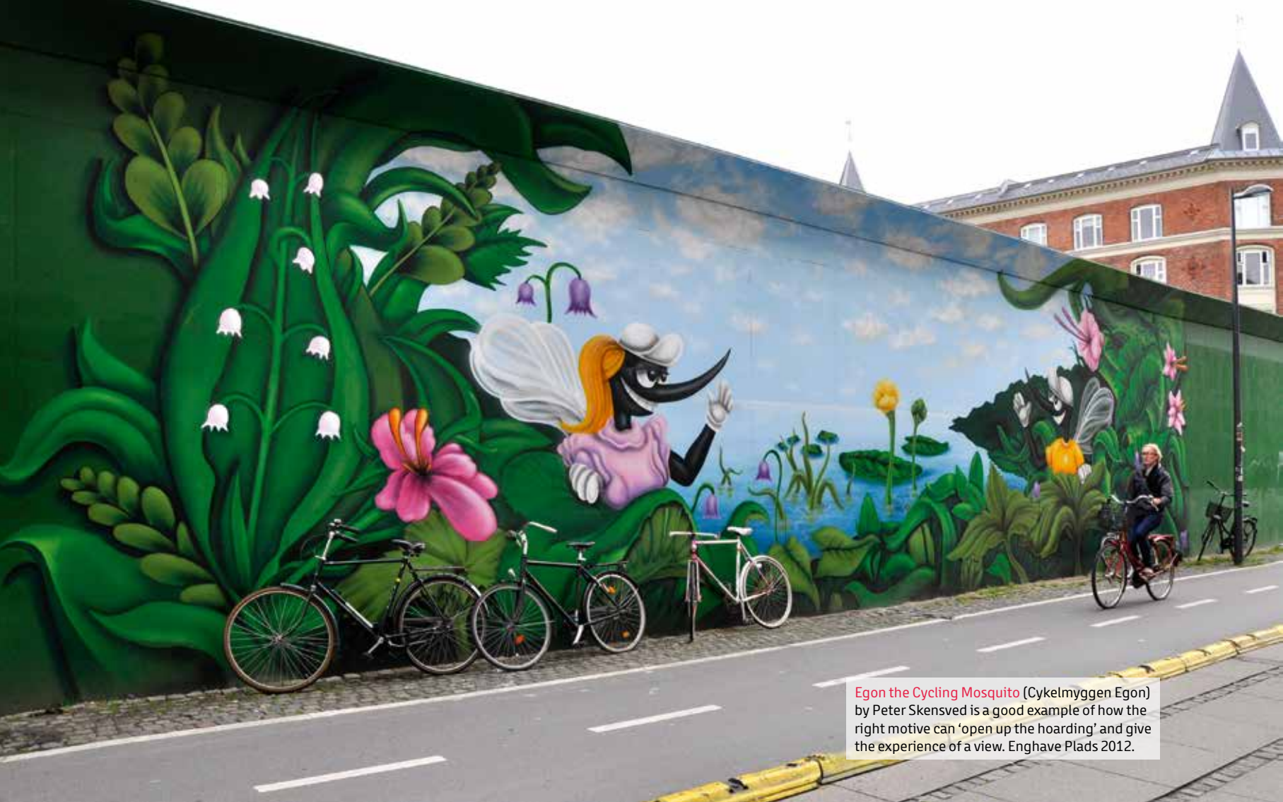
Egon the Cycling Mosquito (Cykelmyggen Egon) by Peter Skensved is a good example of how the right motive can 'open up the hoarding' and give the experience of a view. Enghave Plads 2012.