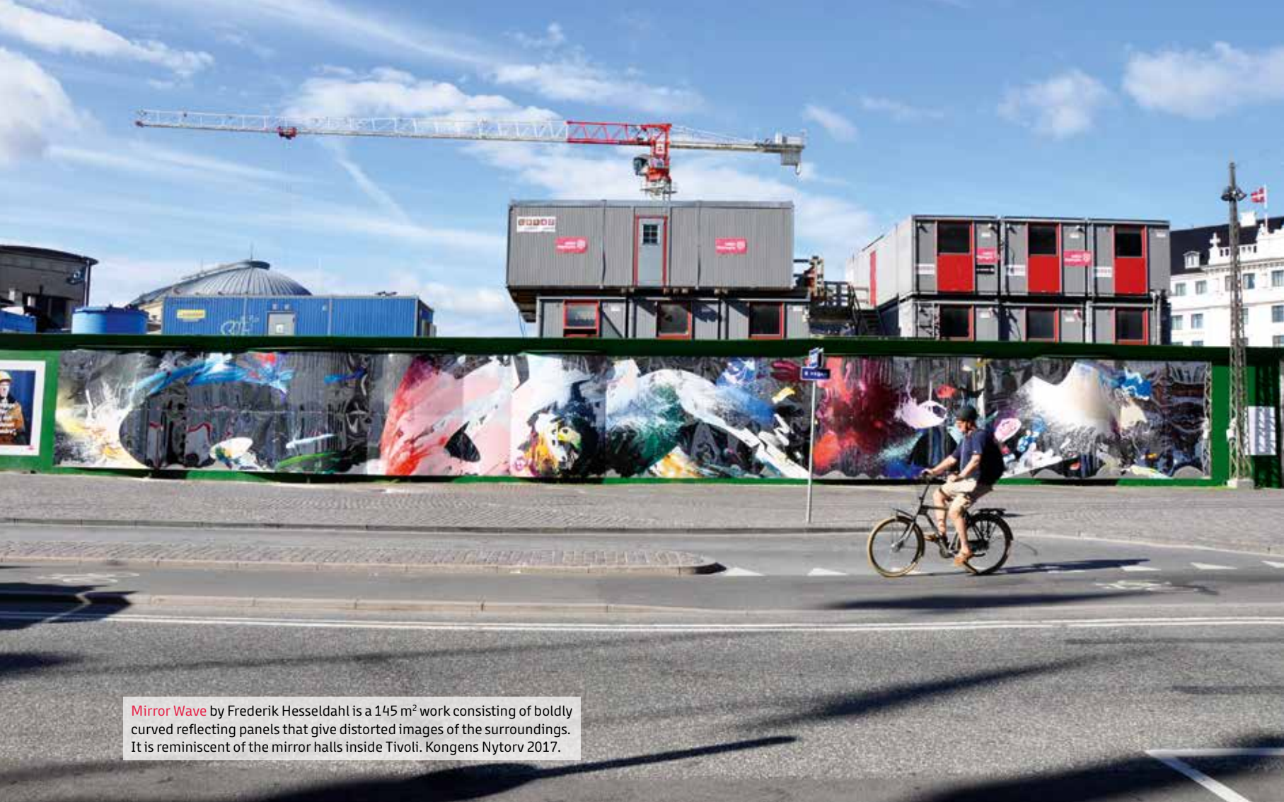
Mirror Wave by Frederik Hesseldahl is a 145 m 2 work consisting of boldly curved reflecting panels that give distorted images of the surroundings. It is reminiscent of the mirror halls inside Tivoli. Kongens Nytorv 2017.