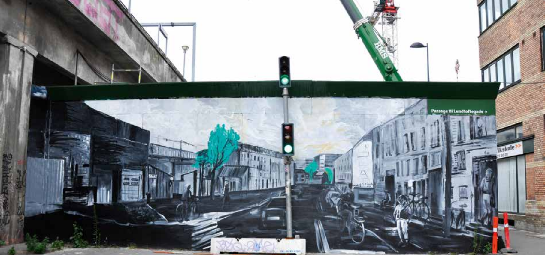
When a street is closed off with hoarding, it can seem cramped and restricting. But if the hoardings are painted with a motif with perspective, the space suddenly feels far less constricted. City Instagram on the City's Hoardings (By instagram på Byens Hegn) by Marija Griniuk. Nørrebro Station 2016.