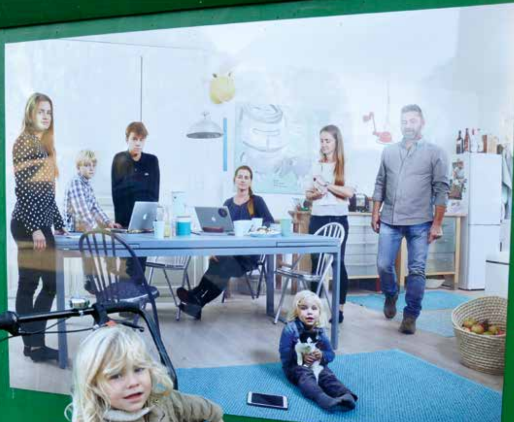
Photographer Ken Hermann shows a rare glimpse into the homes of 17 residents of Brumleby at Østerbro in a series of photographs titled A Village in the City – Portraits from Brumleby (En landsby i storbyen – portrætter fra Brumleby). The photo exhibition was displayed at Triangeln, just around the corner from Brumleby, so the residents passed by the portraits daily. Triangeln 2015.