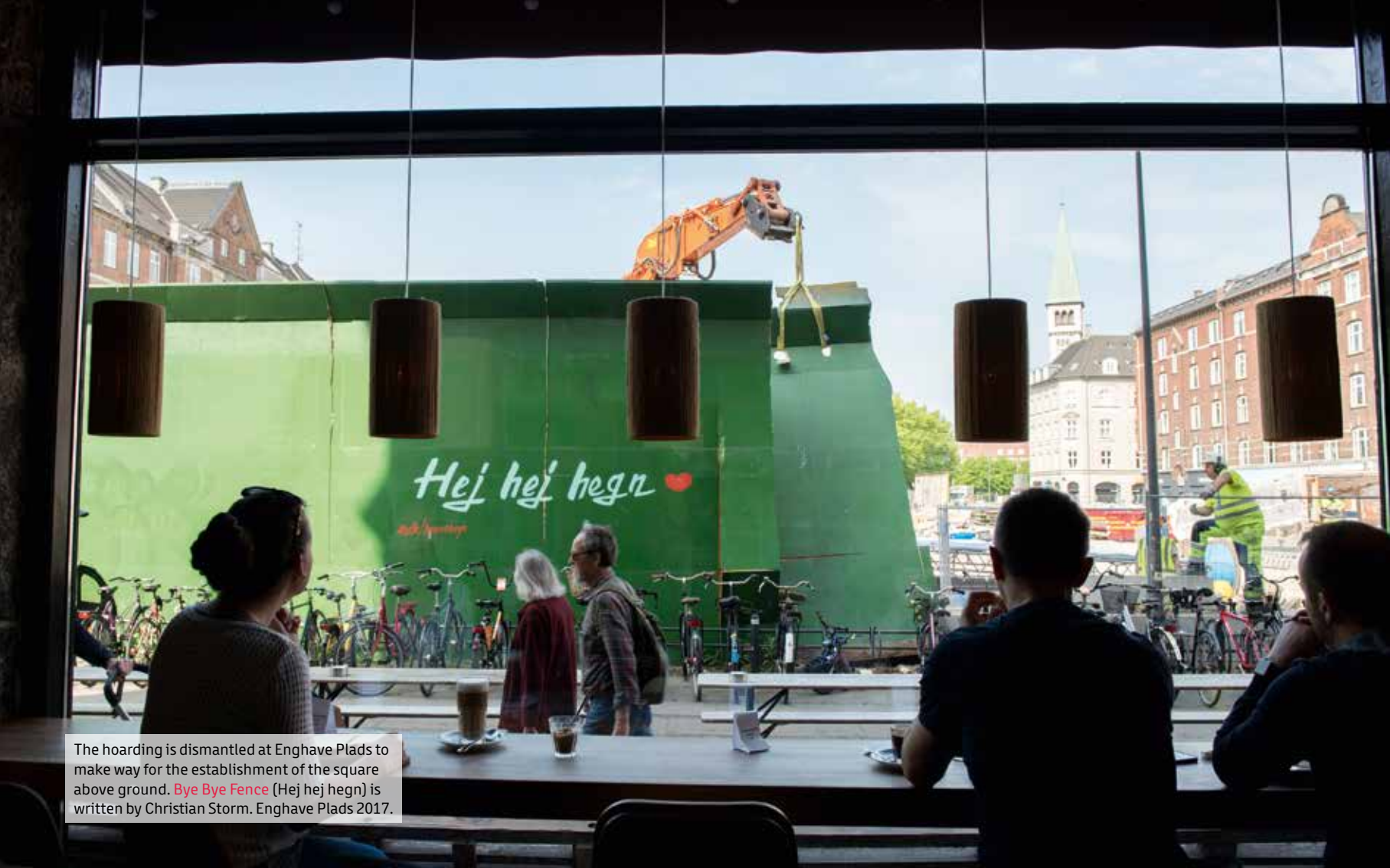
The hoarding is dismantled at Enghave Plads to make way for the establishment of the square above ground. Bye Bye Fence (Hej hej hegn) is written by Christian Storm. Enghave Plads 2017.