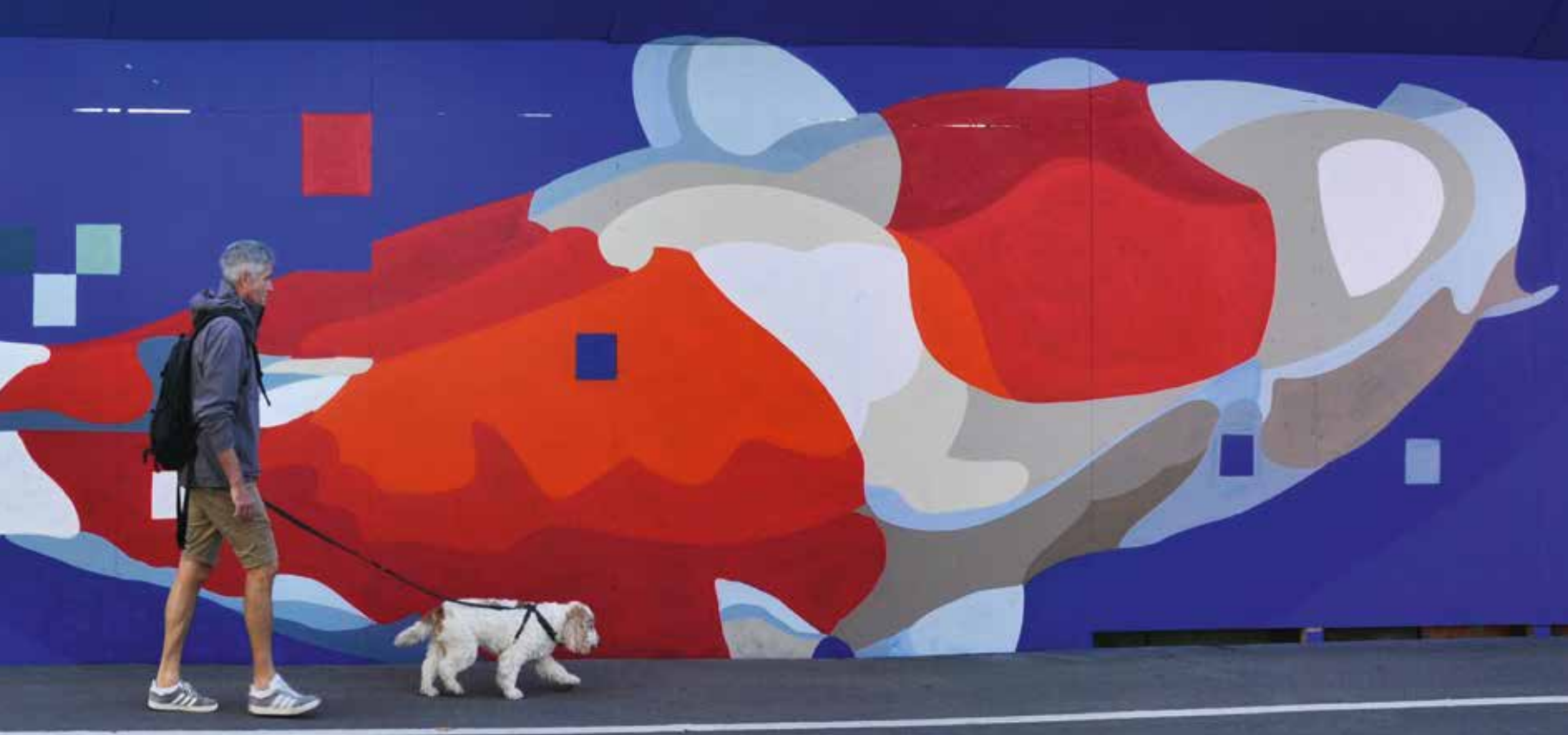
Cool Construction – Temporary Urban Art