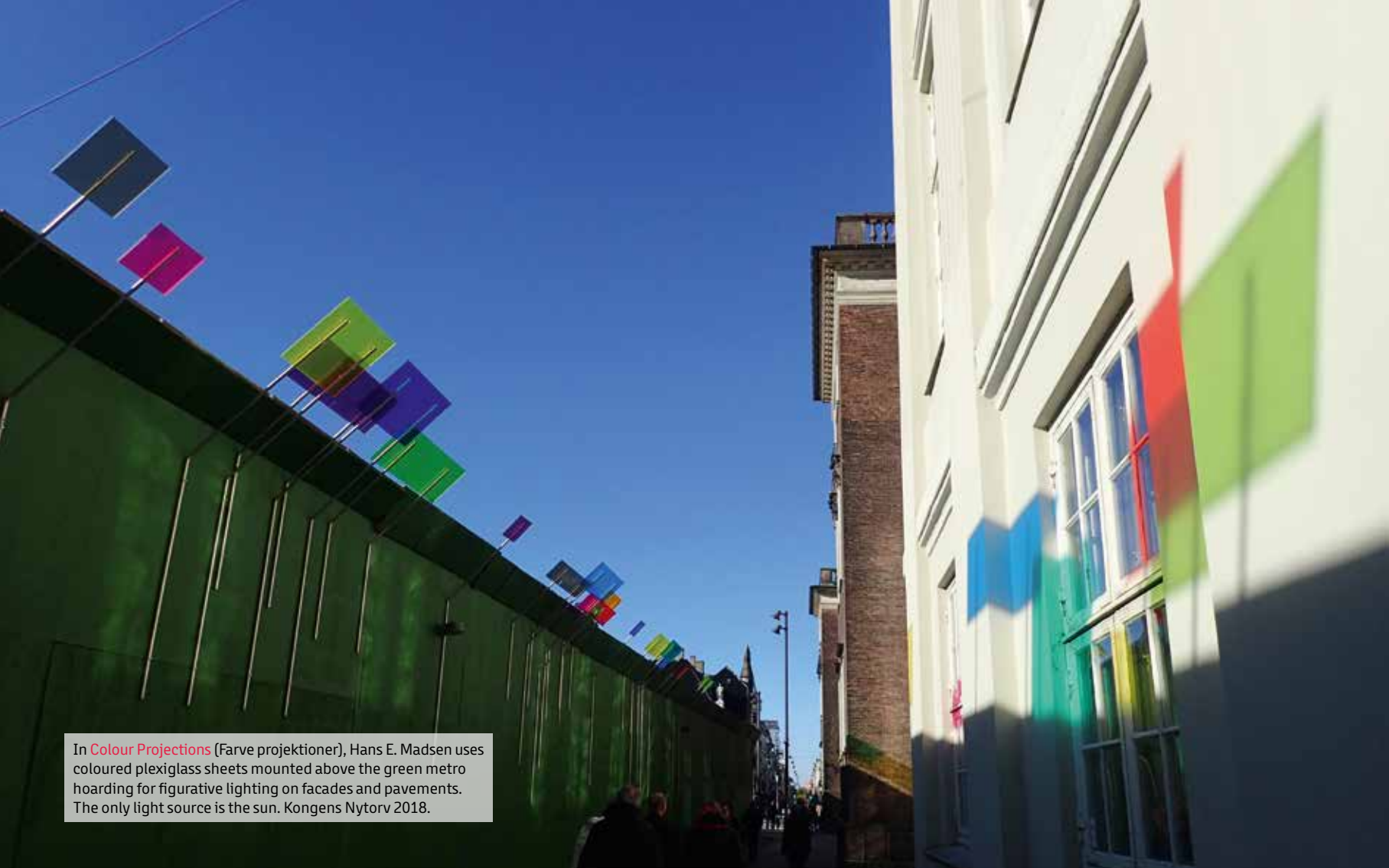
In Colour Projections (Farve projektioner), Hans E. Madsen uses coloured plexiglass sheets mounted above the green metro hoarding for figurative lighting on facades and pavements. The only light source is the sun. Kongens Nytorv 2018.