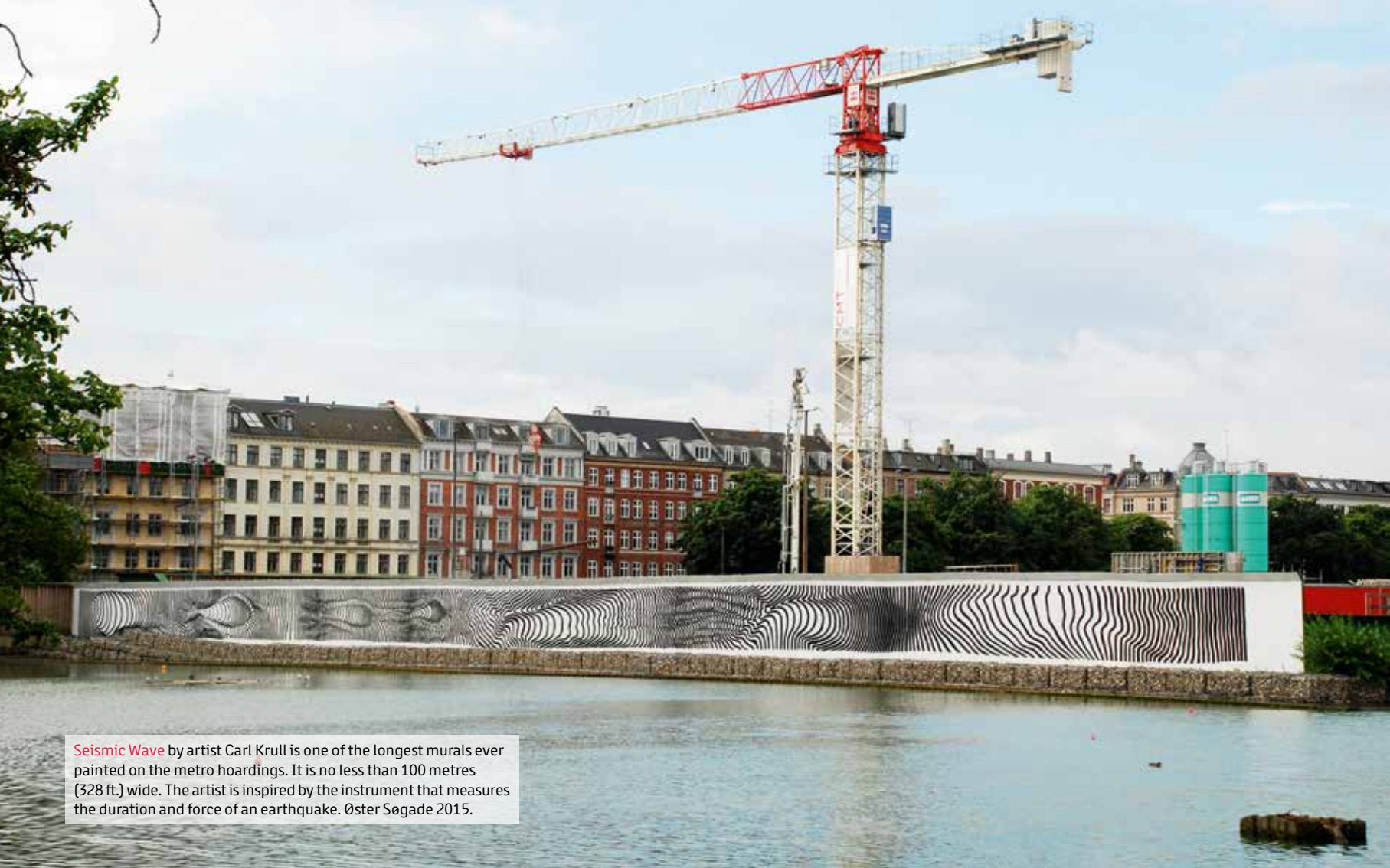
Seismic Wave by artist Carl Krull is one of the longest murals ever painted on the metro hoardings. It is no less than 100 metres (328 ft.) wide. The artist is inspired by the instrument that measures the duration and force of an earthquake. Øster Søgade 2015.